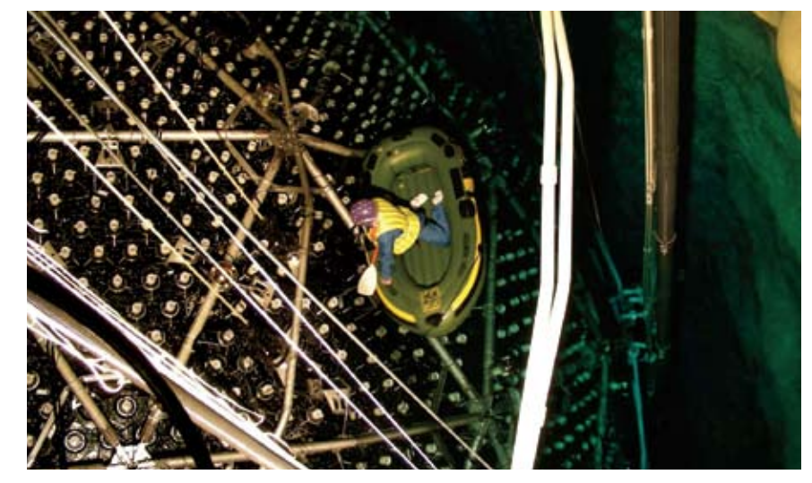
A physicist boats in water surrounding Canada's SNO detector, which is filled with heavy water to detect neutrinos. A new fluid will be used to detect geoneutrinos.

SNO+ is the furthest along of the up-and-coming geoneutrino experiments. Other detectors under discussion include one in the Homestake mine in South Dakota and a large detector to be built in Europe, possibly in Finland. Startup and operating costs are estimated to be on the order of hundreds of millions of dollars, and construction